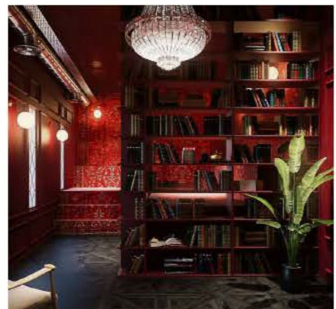
ABOVE: The Library in Iconic Office, South Point. RIGHT: Private office space on Stephen's Green.

human behaviour and creates timeless environments. ■ What would be a dream project for you to work on? >> I recently experienced the wonders of Donald Judd's former Spring Street home in New York. The Judd Foundation offers guided tours and it was amazing! I would love to design a creative hub in a New York cast iron warehouse, like Judd's home, showing the perfect balance between gallery space and home environment. ■ Have you any design tips for us? >> Embrace colour — it's the most dramatic way to change a space. It's also the least expensive. Don't be safe or take it too seriously. I would encourage people to change around their spaces. Move furniture around, be