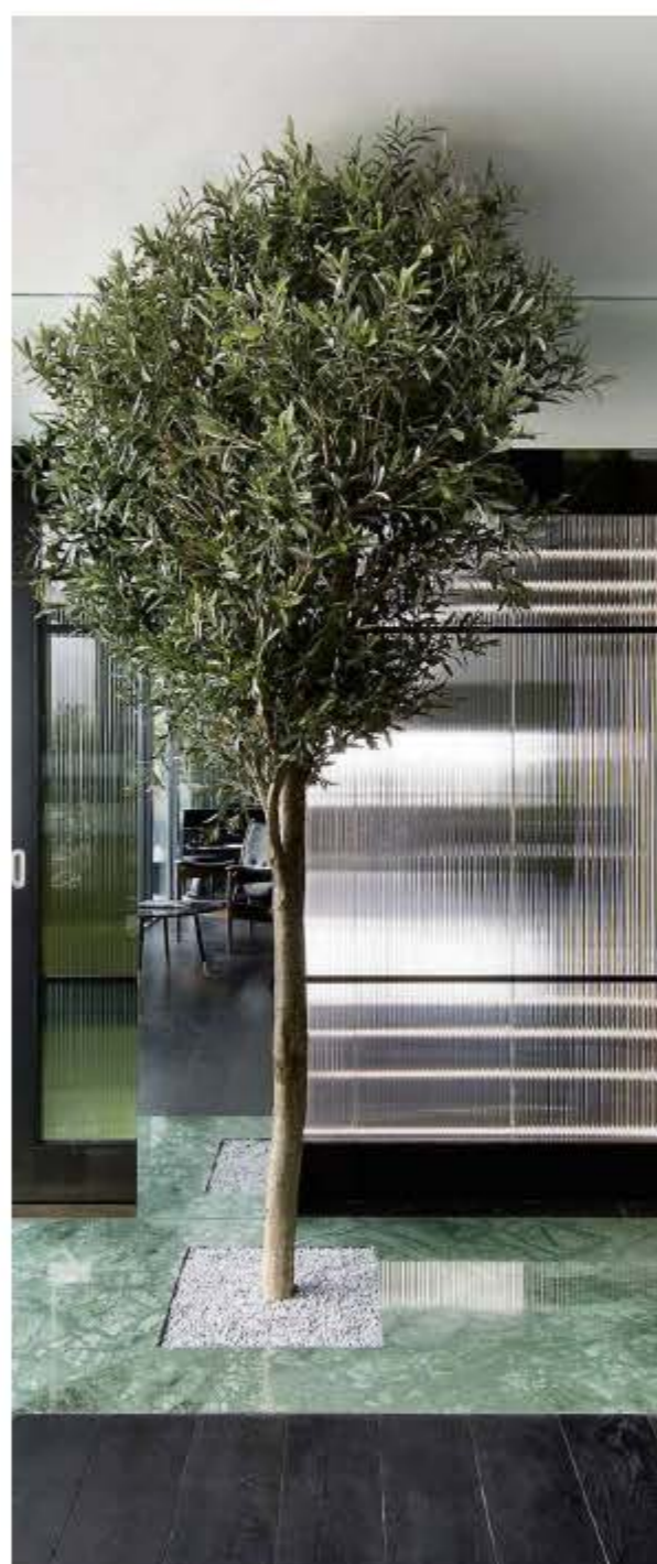
Private office space on Stephen's Green.